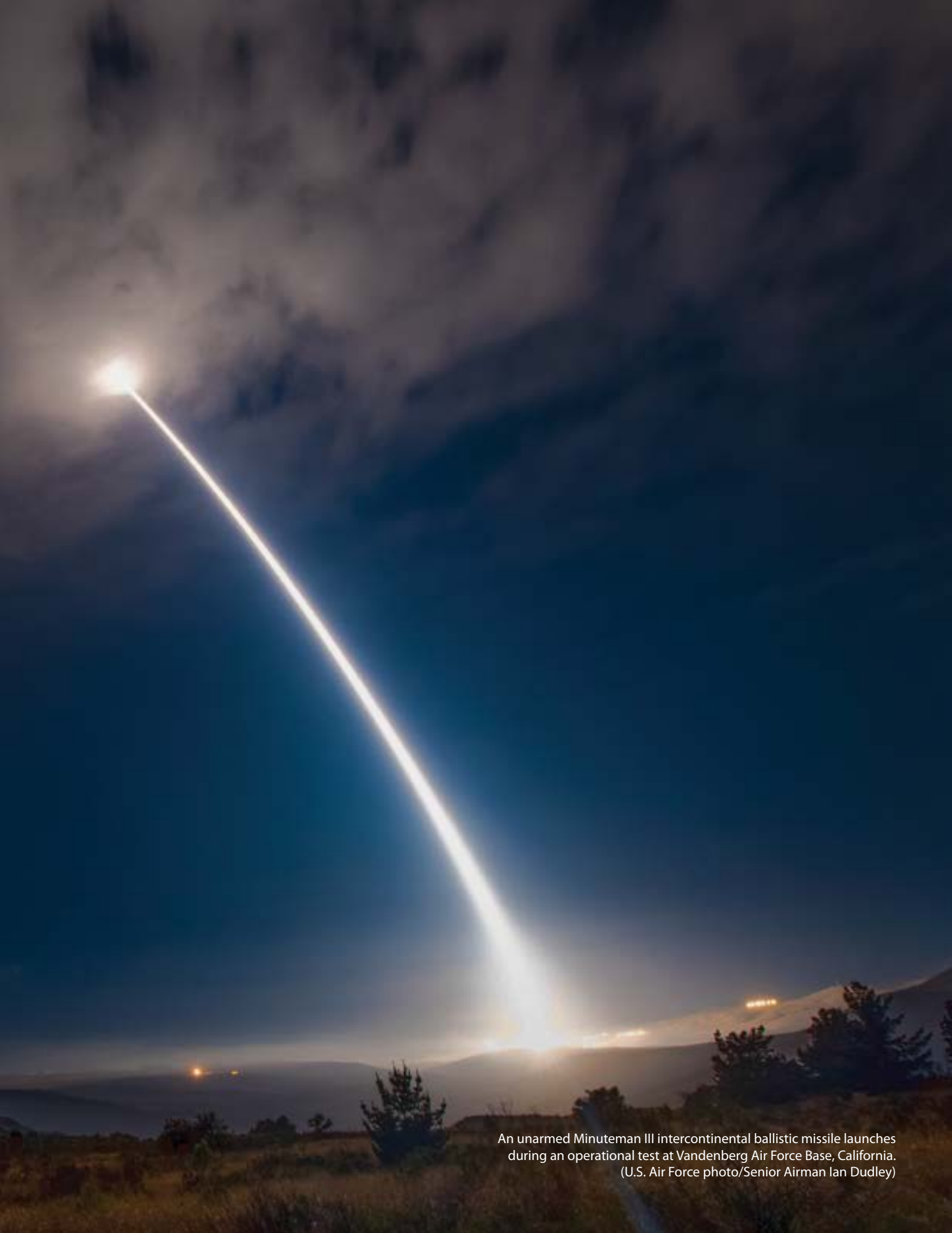
An unarmed Minuteman III intercontinental ballistic missile launches during an operational test at Vandenberg Air Force Base, California.