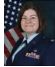
Lieutenant Colonel Rhea A. Lagano, USAF

The SVC program has greatly expanded in its short existence. Today there are over fifty Air Force SVCs and Senior SVCs, and over thirty SVPs spread throughout the five circuits at over forty-two military installations. As the program continues to expand and evolve, especially in light of the Military Justice Act of 2016, we anticipate more victim-related changes in the future. AFGM 2016-01 to AFI 51-504 is one example of the most recent developments in the SVC program, and this article highlighted only some of the changes in the AFGM. If you have questions about the SVC program, SVCs and SVPs stand ready to assist in any way possible and to aid victims of sexual assault navigate the winding road through the justice process. R